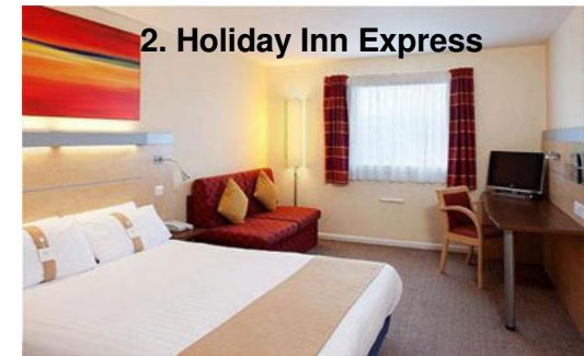
2. Holiday Inn Express

Rating: 4.5 of 5 Food Served No Car Parking Available