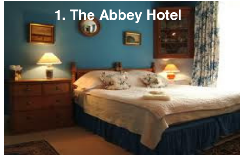
1. The Abbey Hotel

3. Hotel Penzance Britons Hill, Penzance, Cornwall, TR18 3AE 01736 363117 No Vattenfall Contracted Rate Hotel Penzance is just under 15 minutes walk from the office.