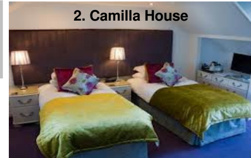
2. Camilla House

Rating: 4 of 5 Food Served Car Parking Available