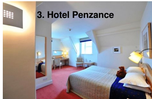
3. Hotel Penzance

Rating: 4 of 5 Food Served No Car Parking