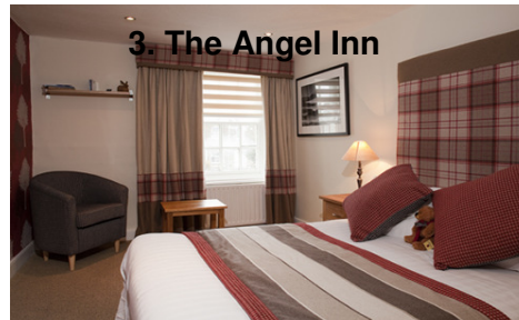
3. The Angel Inn

Rating: 3 of 5 Food Served Limited Car Parking Available