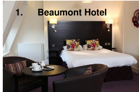
1. Beaumont Hotel

4. Slaley Hall Hexham, Northumberland, NE47 0BX 0845 402 8402 Vattenfall Rate: £85.00 B&B Slaley Hall is situated out in the Northumberland countryside approximately 9 miles from Hexham with a drive of 20 minutes to the office.