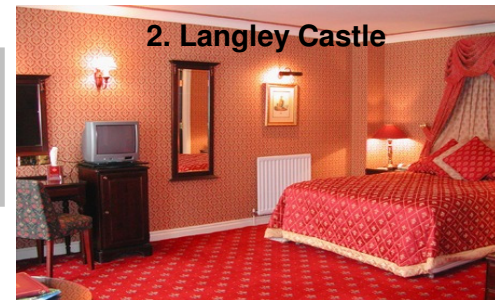
2. Langley Castle

Rating: 4.5 of 5 Food Served Car Parking Available